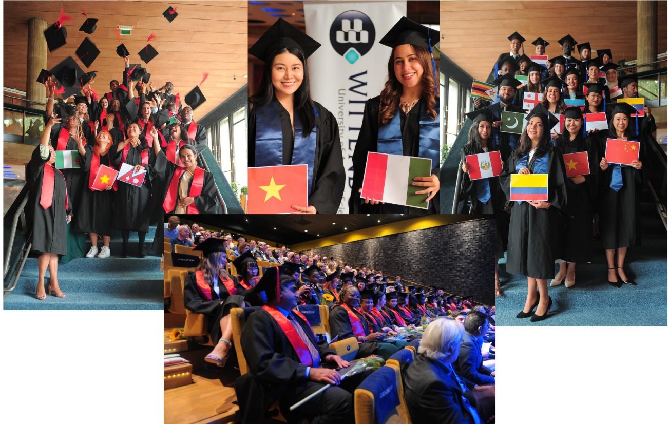
(Above: Bachelor & Master Graduation. At the Orpheus Theatre Apeldoorn)

That leaves me and our wonderful team at Wittenborg only to wish you all an enjoyable and productive study time with us!